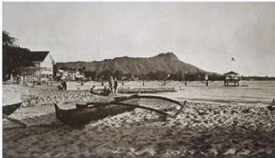
In front of Outrigger Canoe Club • Waikiki Beach • 1917

power tens see automatics ready all set position, paddles ready to enter water repetitions repeated individual strokes making up a change steersman ho`okele : seat six, back of the boat, captain of the canoe stroker seat one, sets tempo for crew timing paddling in synchrony at every phase of the stroke une use the paddle as a lever to control direction